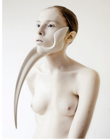
Ana Rajcevic Animal: The Other Side of Evolution 2012