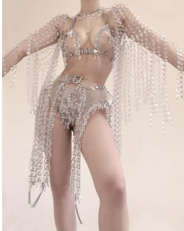
Yeha Leung Nipples are removed please don't attack me @ instagram 8 July, 2018